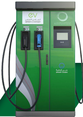
Fast Charger (43 kW AC with Type 2 Socket, 50 kW DC ChadeMO and Combo CCS Sockets). Most of these are installed at petrol stations