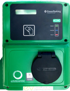
Home or Office -Wall-Box (22 kW AC, with single Type 2 Socket)

There are four types of electric vehicle charges: