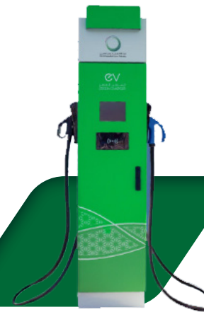
Ultrafast Charger (150 kW DC with type 2 Socket)